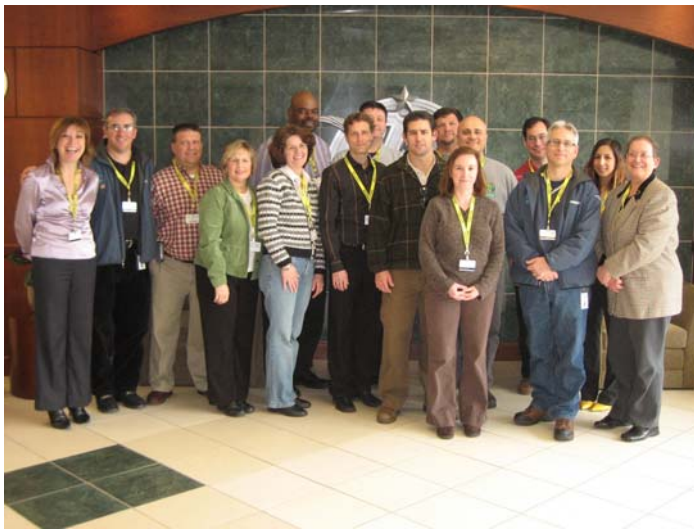
ANJHHWC members at their March, 2008 meeting hosted by Anheuser Busch.